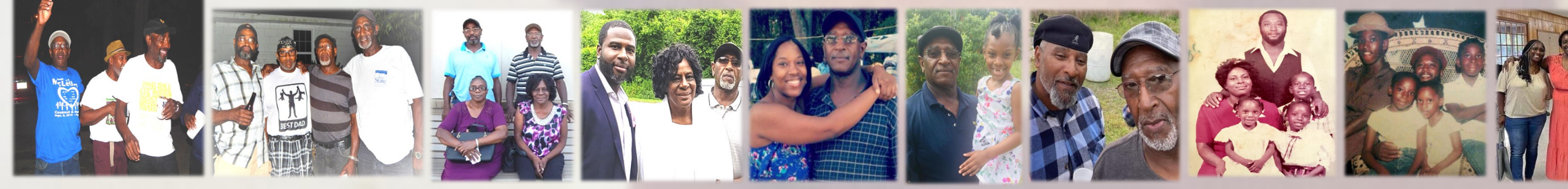
..... Musician ......The Clergy and The Family